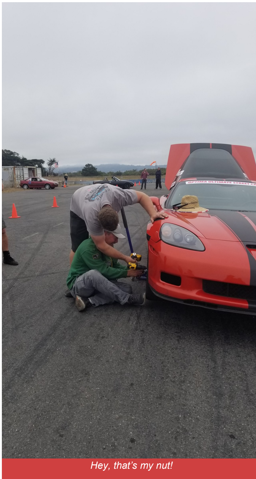
Hey, that's my nut!